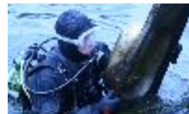
THE DIVERSITY OF LITTER IS STAGGERING. WE HAVE EVEN FOUND THE KITCHEN SINK!