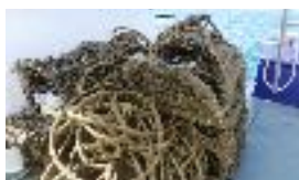
LOST LOBSTER POTS IN SKOMER MARINE NATURE RESERVE